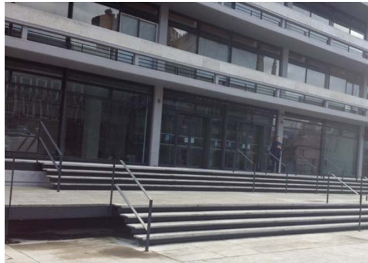
The Printworks Conference Centre